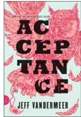
ISBN: 978-0-374-10411-5 352 pages

In Jeff VanderMeer's haunting Southern Reach trilogy, an American wilderness has become a shadowland, concealed by the government for more than thirty years. An environmental disaster zone, Area X is home to strange biological forces that have begun gathering strength. The secret agency known as the Southern Reach has sent in eleven expeditions to discover the truth about Area X, but each team succumbed to violence or illness. Our story begins as a twelfth group is attempting to succeed where all others have failed. Comprised of four women, the team includes a psychologist (the de facto leader), a surveyor, an anthropologist, and a biologist. Their mission is to map the terrain and collect specimens; to record their observations, scientific and otherwise, of their surroundings and of one another; and, above all, to avoid being contaminated by Area X itself. But those who venture across the border bring their own secret histories, creating a world where trust is a fool's game.