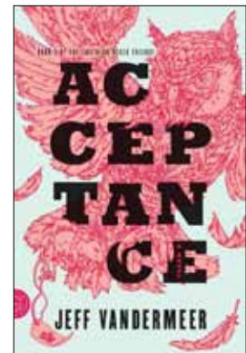
ISBN: 978-0-374-10411-5 352 pages

In Jeff VanderMeer's haunting Southern Reach trilogy, an American wilderness has become a shadowland, concealed by the government for more than thirty years. An environmental disaster zone, Area X is home to strange biological forces that have begun gathering strength. The secret agency known as the Southern Reach has sent in eleven expeditions to discover the truth about Area X, but each team succumbed to violence or illness. Our story begins as a twelfth group is attempting to succeed where all others have failed. Comprised of four women, the team includes a psychologist (the de facto leader), a surveyor, an anthropologist, and a biologist. Their mission is to map the terrain and collect specimens; to record their observations, scientific and otherwise, of their surroundings and of one another; and, above all, to avoid being contaminated by Area X itself. But those who venture across the border bring their own secret histories, creating a world where trust is a fool's game.