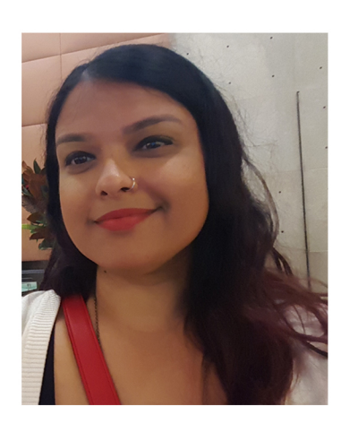
vs. Out in public